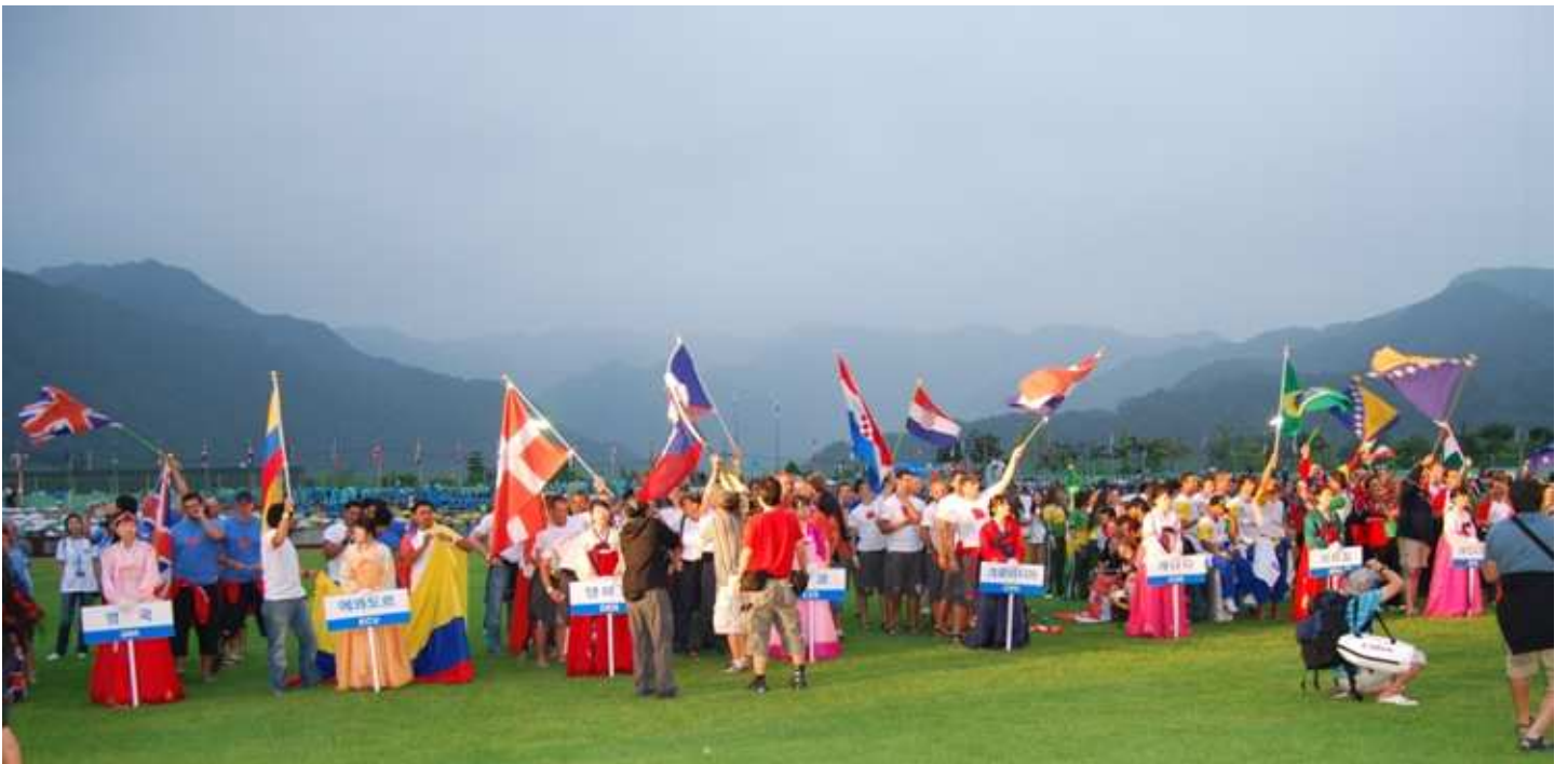
Opening Ceremony —World Rafting Championships—South Korea 2007